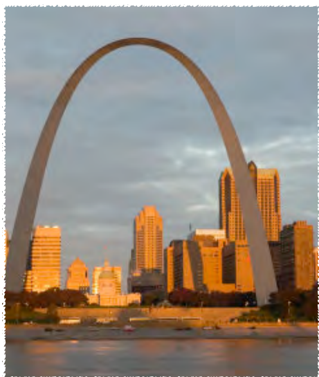
The Mississippi River